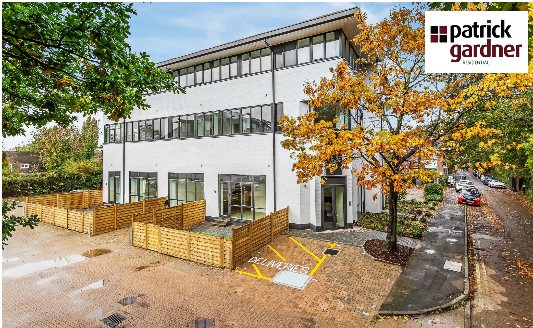
Thornetts House, 15 Challenge Court, Leatherhead, Surrey, KT22 7DE